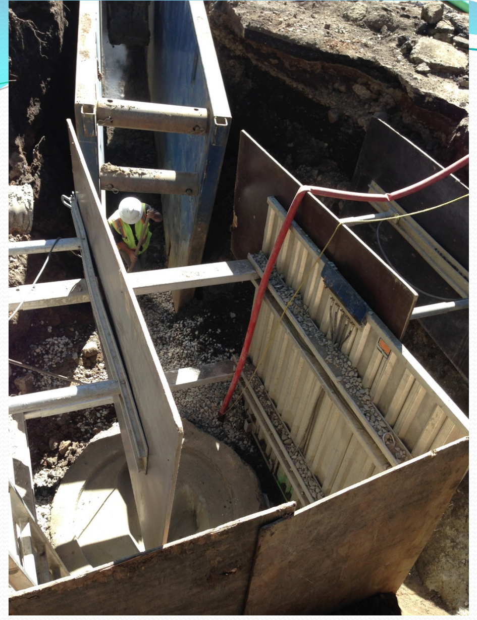
New sewer manhole base, ready for barrels and cone to be stacked; trench box; shoring