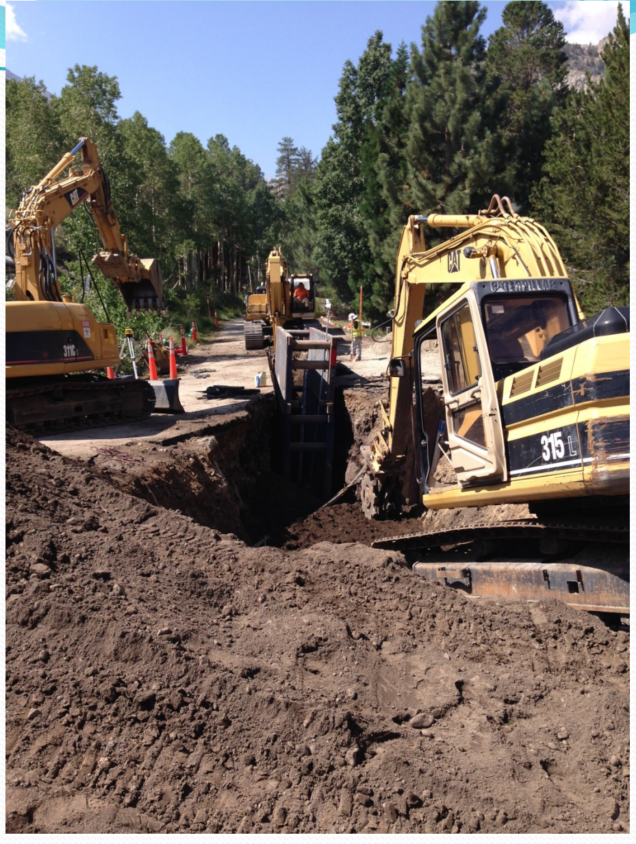
Multitask sewer installation: trenching and installing new sewer line followed by trench backfill and compaction