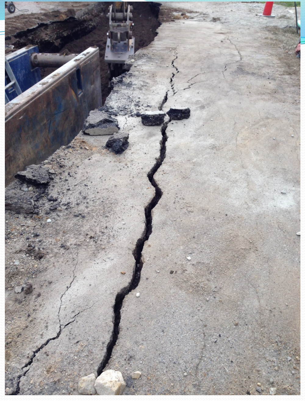
Existing pavement failure due to weak subsoil adjacent to sewer line trench