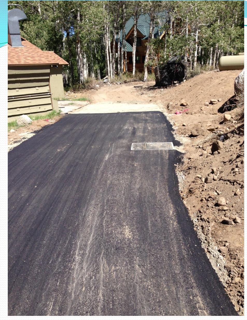
New pavement (Aspendell Mutual Water Company)