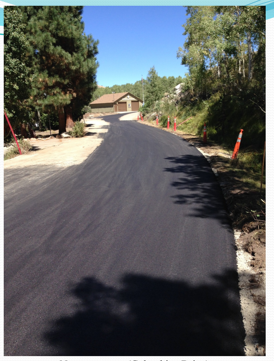
New pavement (Columbine Drive)