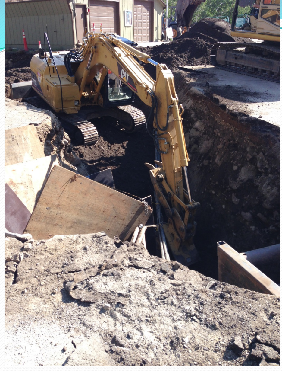
Backfilling new sewer line trench/excavation