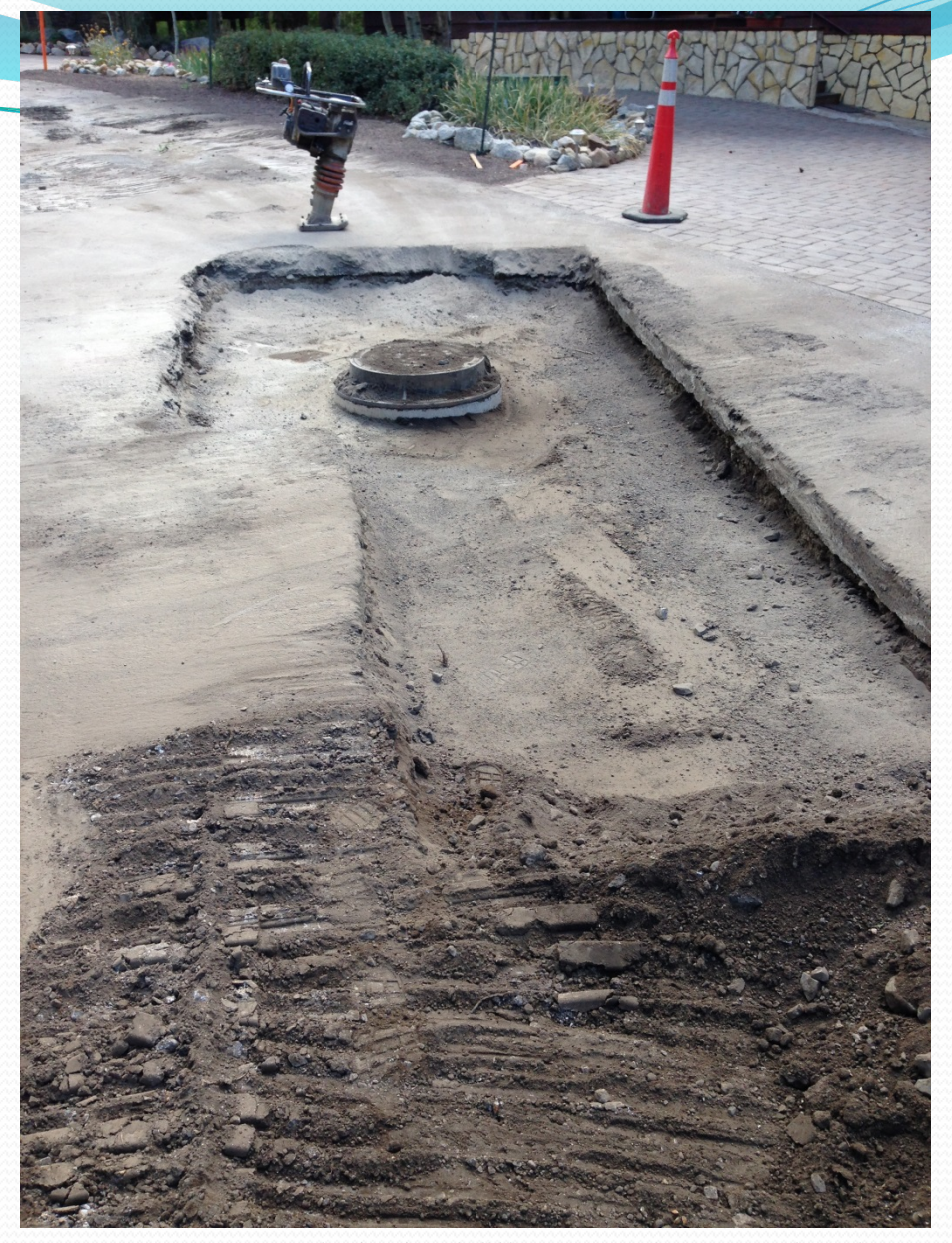
New sewer manhole; backfill compaction completed; ready for repaving