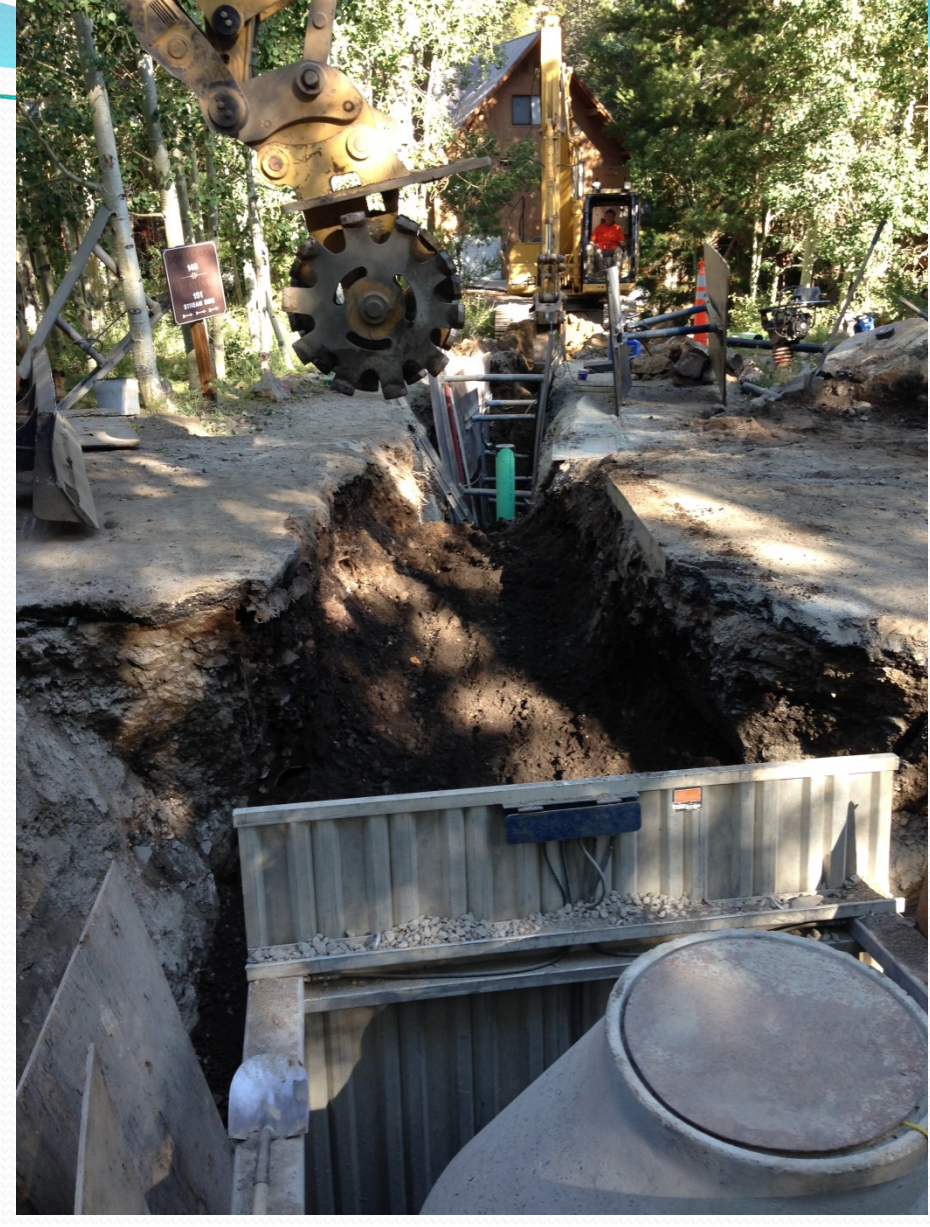
New sewer trench alignment with compacted backfill; new sewer line; shoring; new sewer manhole