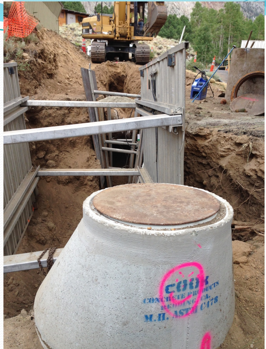
New sewer manhole and trench alignment/excavation with shoring