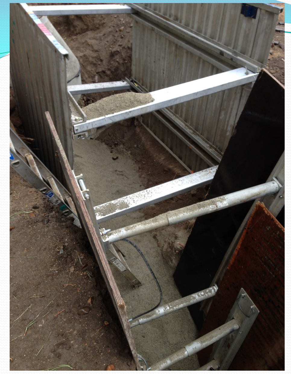
New sewer line trench/excavation with shoring and sand shading