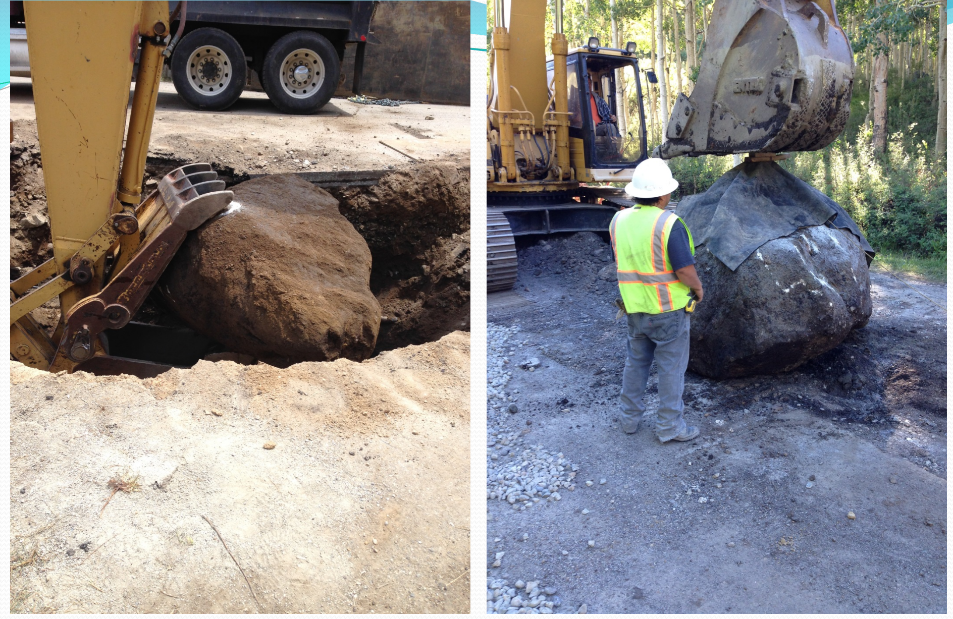
Removing large boulder from new sewer line trench